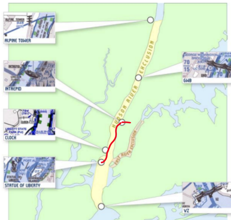
Mandatory reporting points shown. Note: Not for navigational purposes.