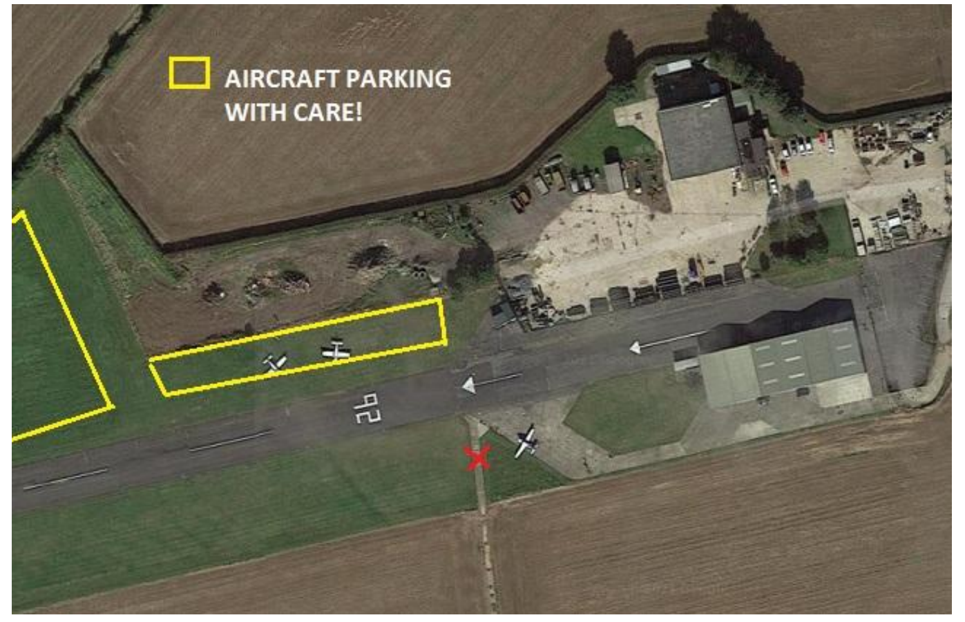
ALL PILOTS: PLEASE PUT YOUR A/C CALLSIGN AFTER YOUR NAME. NOT TO BE USED FOR RW OPERATIONS